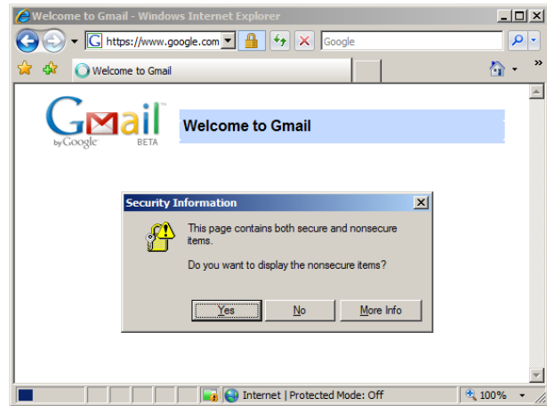
Figure 2: Users have been trained to click through mixed content warnings at sites such as Gmail.

As with certificate warnings, many users do not understand mixed content warnings, and some browsers do not even give users the option of remaining secure. Users have been trained to ignore these warnings because many HTTPS pages, such as the Gmail login